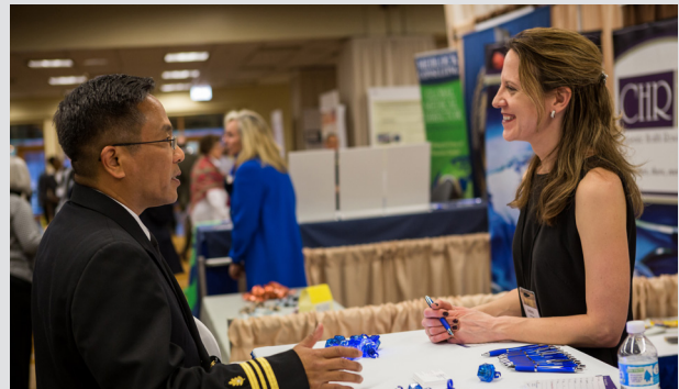
Exhibit Hall Reception

round-table discussion format. A current high impact article will be reviewed. The salient elements to be examined are study hypothesis, study design, selection of the study population, data collection methods, statistical analysis, the role of chance, bias and confounding on internal validity, external validity, and context. Both article and template will be provided prior to the conference. This session was organized by the History and Archives Special Interest Section.